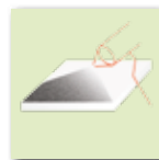
Overlac- quering/ Varnishing