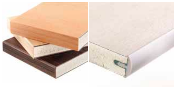
Laminated with HPL, edges sealed with an ABS profile